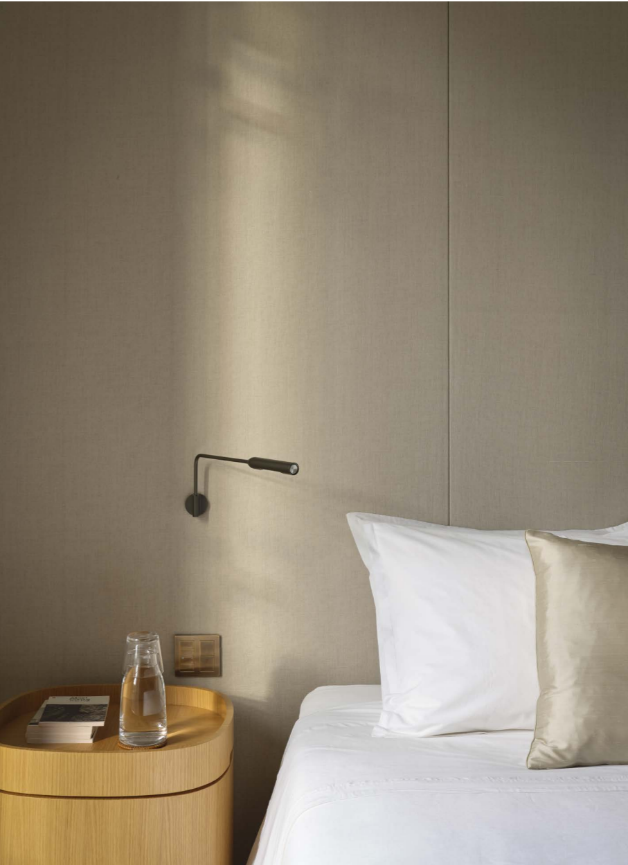
The first-floor junior suite has its own en suite and terrace, complete with free-standing bathtub from The Albion Bath Company. In the bedroom, walls are covered in linen from Belgian textile company Designs of the Time, while the oak bedside table was custom designed by Studio Daminato to include an integrated carrying tray